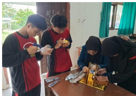
Figure 2. Process from Create Project

At the development and presentation stage, students produced a simple project that utilized alternative energy as a solution to the formulated problem. Their work demonstrated how such solutions could contribute to reducing the negative impacts of conventional energy use, as exemplified by the creation of a basic hydroelectric power plant, as shown in Figure 2.