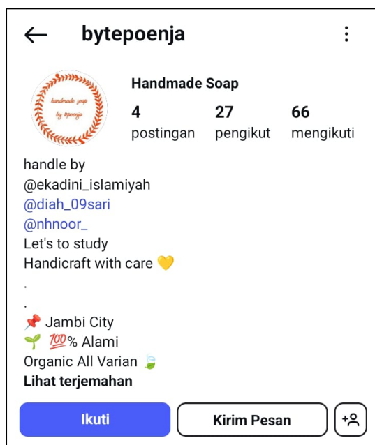
Figure 4. Social Media Account and Branding as an Example of Product Marketing Media

4. Outcomes of the Activity and Digital Media As part of the program outcomes, the community service team utilized social media to document and disseminate the results, as illustrated in Figure 4. An Instagram account and a YouTube channel were created to showcase the training process and final products to a broader audience.