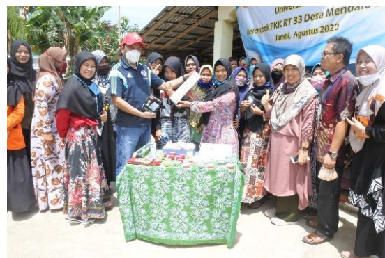
Figure 2. Practical Activities and Aromatherapy Soap Products.

The formulation in Table 1 uses main ingredients such as palm oil, VCO, and citronella essential oil. This composition is adjusted to ensure it can be easily replicated by participants at home, considering the availability of ingredients in their local environment.