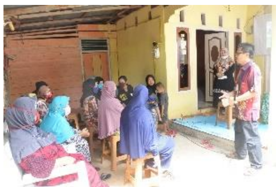
Figure 1. Presentation on the Topic of Aromatherapy Soap.

Figure 1 illustrates the delivery of information regarding the benefits of aromatherapy soap and its economic potential, particularly when using locally sourced ingredients such as citronella essential oil as a natural fragrance.