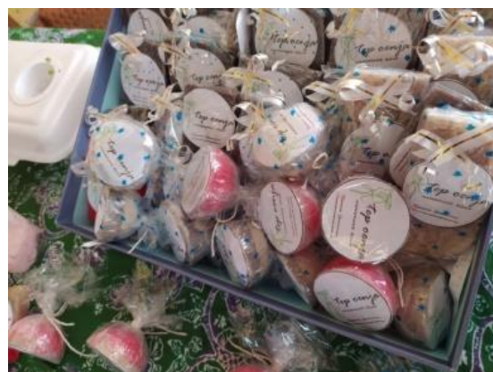
Figure 2. Aromatherapy Soap Products

Although packaging was once considered merely a part of the product concept, it has now become an essential variable in marketing strategies (Rundh, 2016). Packaging design can utilize the material, shape, color, branding, and dimensions of the package to attract customers and inform their decisions in the store or at a retail outlet (Rundh, 2009; Azzi, 2012).