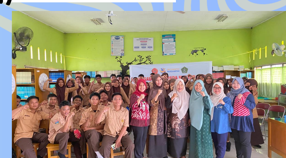
Figure (a) Pre and post-evaluation, (b) Presentation about mental health, (c) Documentation with participants

Pre- and post-test evaluation showed an increase in students' knowledge . The average score rose from 68.21 to 73.33, indicating better understanding and awareness of mental health after the session .