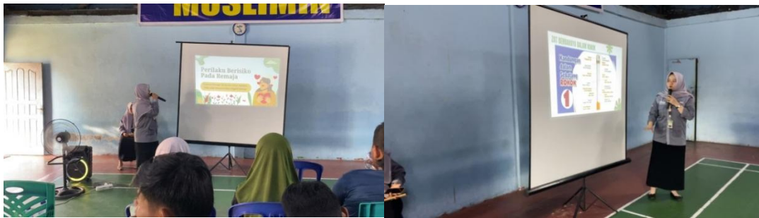
Figure 2. The speaker delivered the education using PPT Media