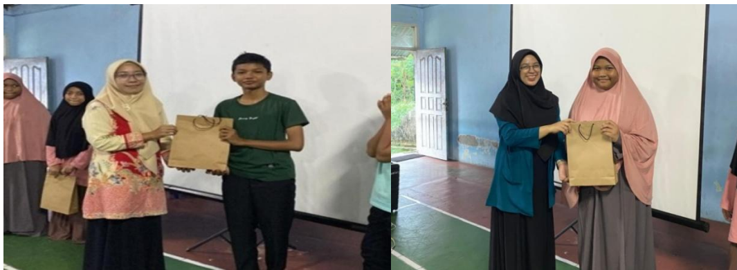
Picture 3. Giving reward to adolescents