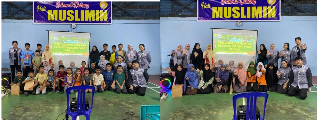
Figure 4. Group photo session