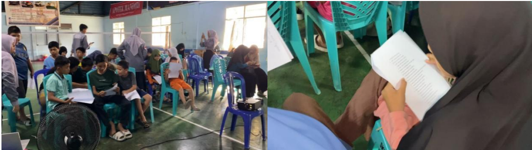
Figure 1. Adolescents fill out pre-test and post-test questionnaires

knowledge, as evidenced by the shift in knowledge categories from inadequate to good following the intervention.