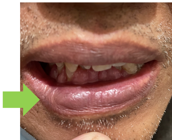
Figure 2. Gingival hypertrophy in patient with long time amlodipine consumption

then referred to our department to change the medication. Subsequently, a change in medication was recommended, and the patient started taking candesartan (16 mg). After 6 weeks, there were no significant complaints related to mastication and bleeding tendency, and the swelling was improved.