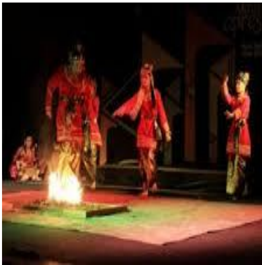
Figure 1 Performance of the Niti Naik Mahligai Dance in East Kalimantan

arise as a result of human needs and creativity. This can be seen in the Niti Naik Mahligai dance, which, from the past to the present, has retained its movements but has undergone various changes in the form of its performances to achieve a more appealing presentation. After the changes in function, performance, and elements of the Niti Naik Mahligai dance, it can now be performed at various events. The following is one of the documented performances of the Niti Naik Mahligai dance: